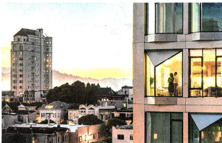
BY DESIGN Trumark Urban, developers of the Pacific building in San Francisco with units up to $15.5 million, had a broker advisory board of top-selling agents.